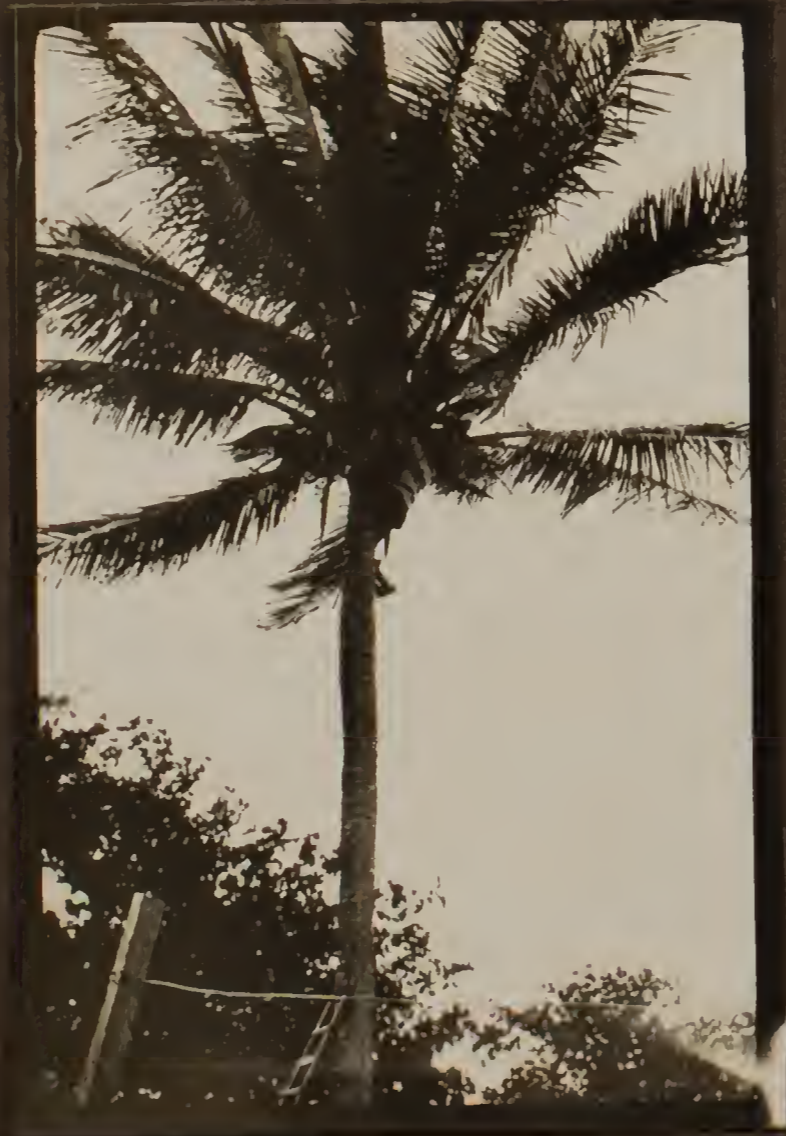
Andy up Coconut Palm 19 01 26